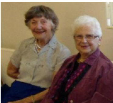
Thanks to all who participated in the church bake sale.

Presbyterian Women wish the families of Peace Memorial a happy and healthy 2012.